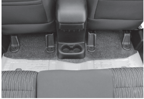
FIGURE 5: FIGURE 6: FIGURE 7: