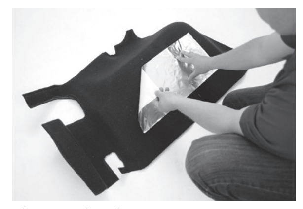
FIGURE 1: HEAT SHIELDS

IMPORTANT: Jeep floor should be at least 68°F (20°C) for maximum adhesion. Clean all areas with rubbing alcohol before applying tape. When removing backing, do not touch adhesive.