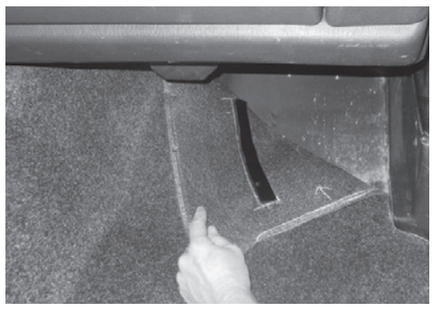
FIGURE 2: FIGURE 3: FIGURE 4: